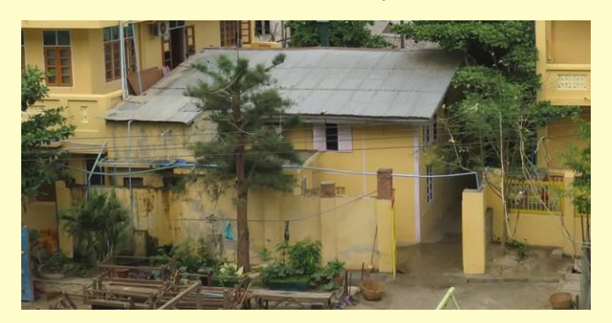
4. Facilitating the English & Life Skills Program

In the future we would like to rebuild House 1. Our project started fifteen years ago with the purchase of this house. It is now used temporarily for sleeping. We would like to eventually replace the building with a large kitchen, work space, office space and dormitory.